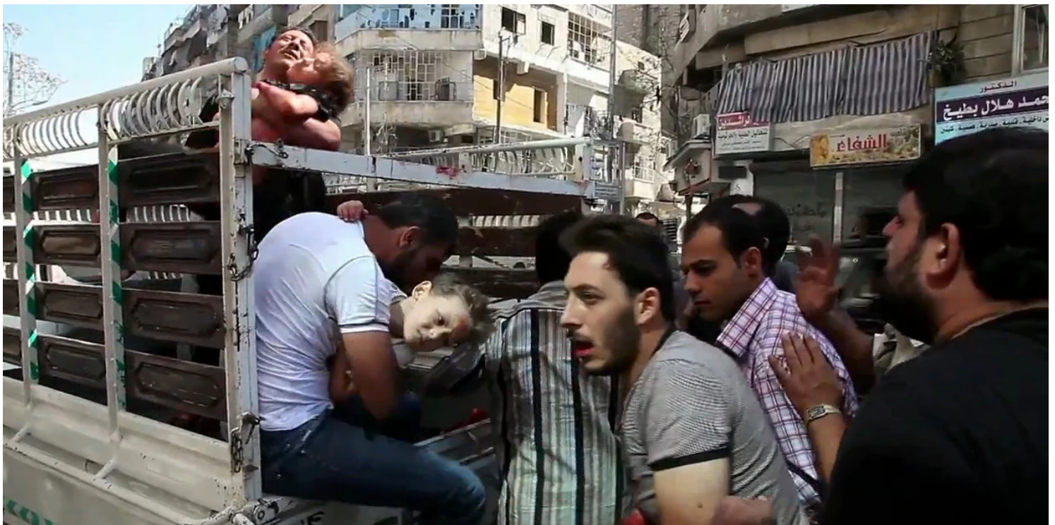
Wounded civilians arrive at a hospital in Aleppo during the Syrian civil war.

Warmer temperatures translate to an uptick in violence. A 2013 review paper (http://science.sciencemag.org/content/early/2013/07/31/science.1235367) published in Science examined 60 papers across various disciplines that correlated extreme weather with violence. The trend was remarkably consistent: More heat equals more conflict. “It was striking for us to read about everything from Hindu-Muslim riots in India, to land invasions in Brazil, to crime in Australia, to civil war in Africa, domestic violence in the U.S.,” lead author Edward Miguel tells Inverse (/article/18789-climate-change-global-warming-violence-extreme-weather-heat-economics) . “Nearly all of them showed this relationship where higher temperature was associated with more violence.”