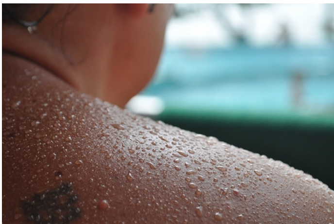
Researchers found that higher temperatures led to an increase in violence throughout the world.

Climate changes that lead to abnormal temperatures and dangerous weather patterns can be very stressful. People who are used to mild rain but are then bombarded with hurricanes and tropical storms might be unprepared, leaving them with more damages than they can handle. Since climate changes can impact one's life drastically, a new study decided to venture into finding any associations between climate changes and conflicts on a global scale. According to this study done by researchers from the University of California, Berkeley and Princeton University, climate shifts have and still contribute to human conflicts and violence throughout the world.