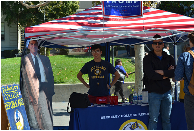
In the year of Trump, student Republicans at odds