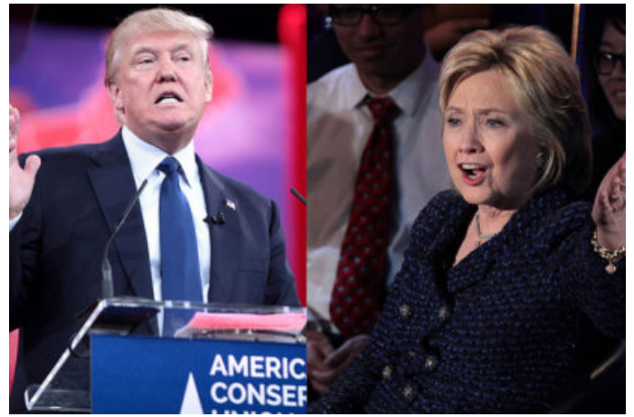
Where to watch the final presidential debate