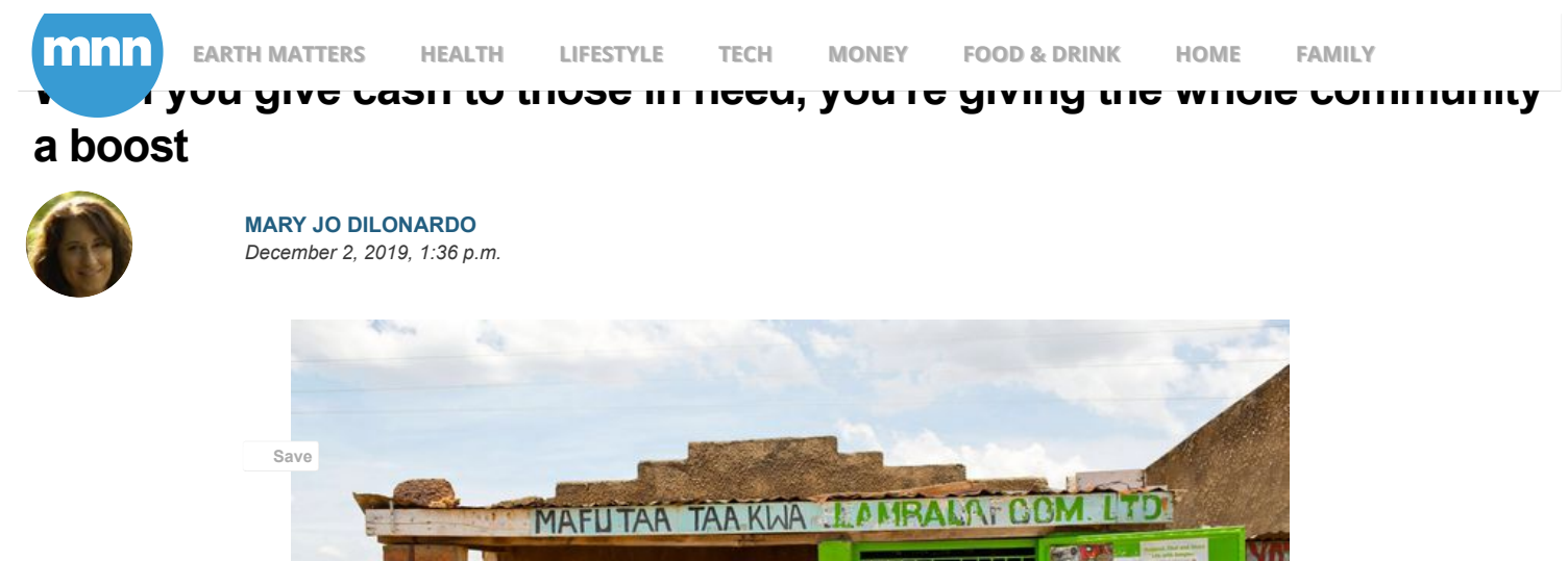
When people were given cash in Kenyan households, they were able to spread the wealth to others in the community.

When you give cash to those in need, you're giving the whole community a boost | MNN - Mother Nature Network