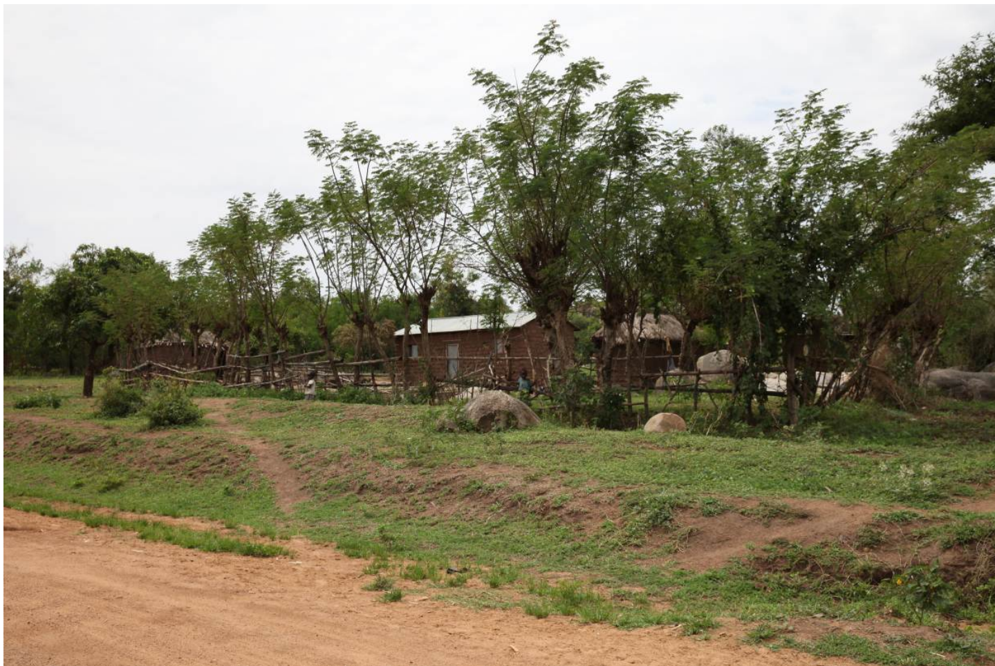
A view of Nyashana village in north-western Tanzania, from the roadside on 21 February, 2017.