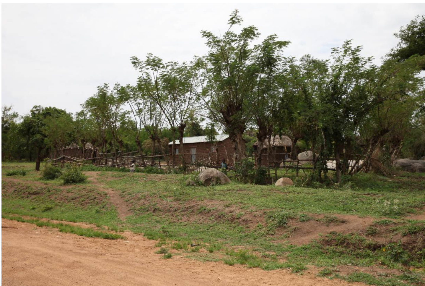
A view of Nyashana village in north-western Tanzania, from the roadside on 21 February, 2017.