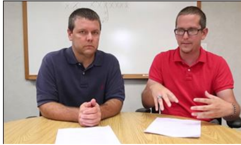
FEARLESS FORECAST: High school f...

Log in | Subscribe | Contact Us | Submit News Tip