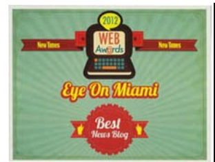
New Times' Web Award