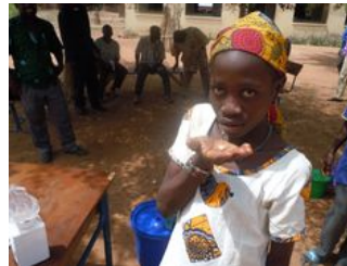
A girl takes her deworming tablet.

Here's a fresh example of a study that turned out not to be reproducible, because the results couldn't be replicated: as Ben Goldacre relates in BuzzFeed, two economists published a massive study in 2004 claiming that a "deworm everyone" approach in Kenya "improved children's health, school performance, and school attendance," even among children several miles away who didn't get deworming pills. Endorsed by the World Health Organization, it helped set policy that affects hundreds of millions of children annually in the developing world.