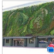
Ecoroofs and Living Walls