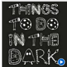
Earth Hour 2013